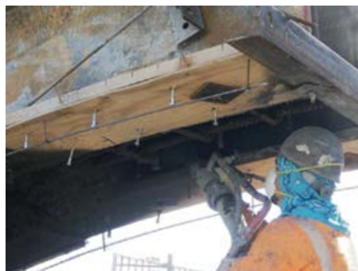
Fig. 6: Shooting the mockup

the conversion was accomplished with minimal down time.