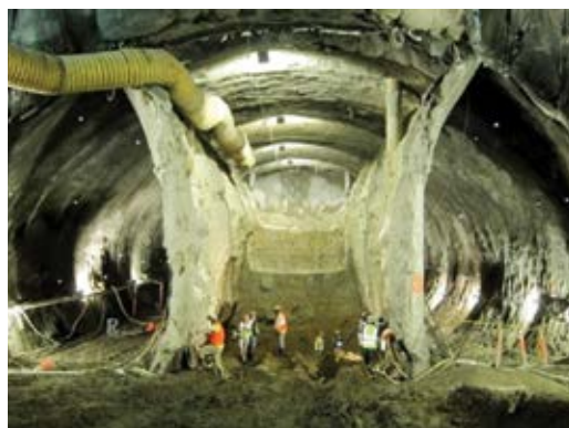
Fig. 2: CQ039 Excavation