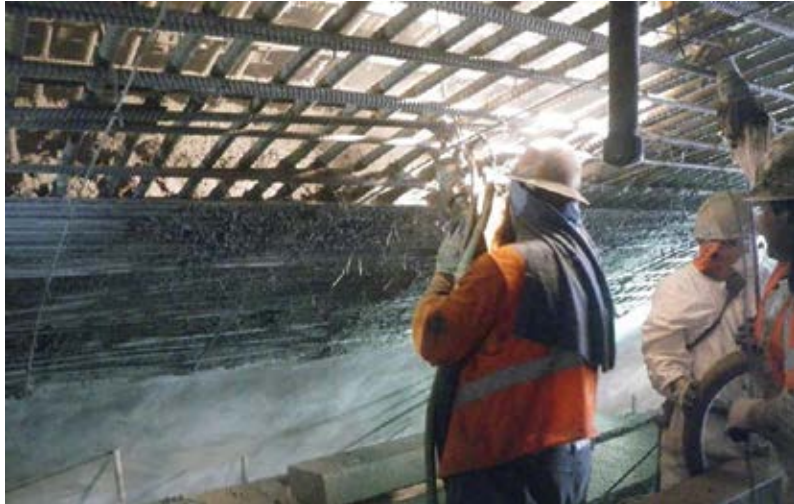
Fig. 7: Nozzle in outer layer of reinforcement, encasing the back layer