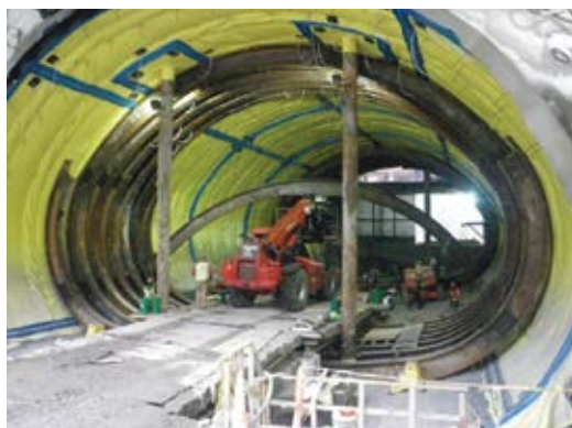
Fig. 4: Waterproofing and ring girders being installed