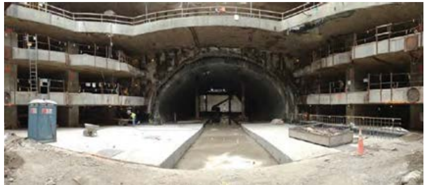
Fig. 9: Finished tunnel looking east to west under Northern Boulevard