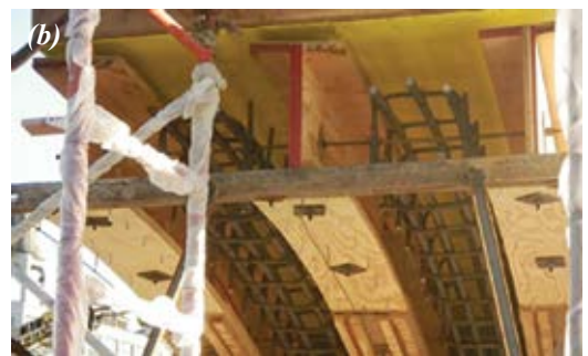
Fig. 5: Mockup of ring girder shoot