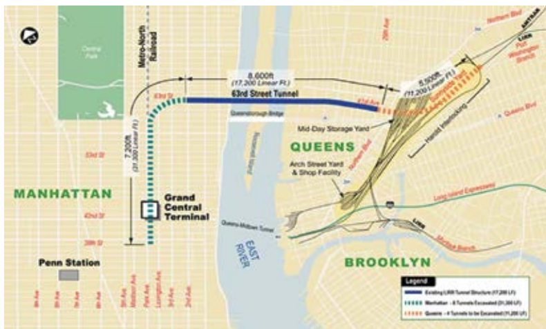
Fig. 1: East Side Access overall project scope

Due to the site constraints, laydown area was limited. We installed our primary and backup pumps inline so if we had mechanical issues we could easily swap the line and deal with the pump on the off-shift. This system proved important, as three times we had to divert to an alternate pump. Because the pumps were inline,