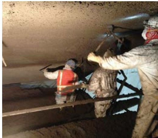
Fig. 8: Cutting of guides and finishing